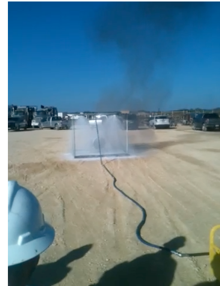
@ 3 seconds