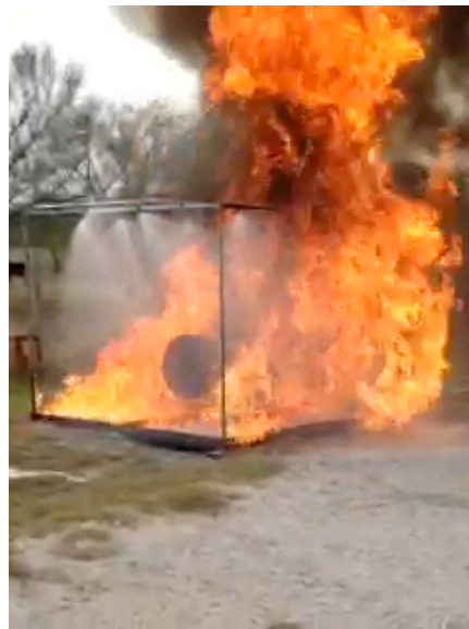
@ 4 seconds