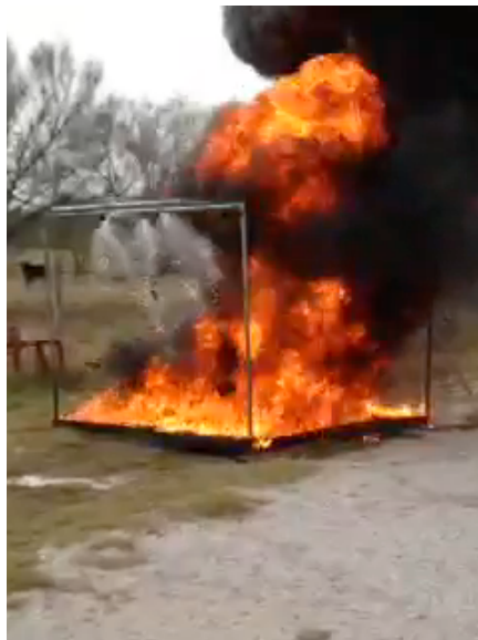
Video: @ 0 seconds