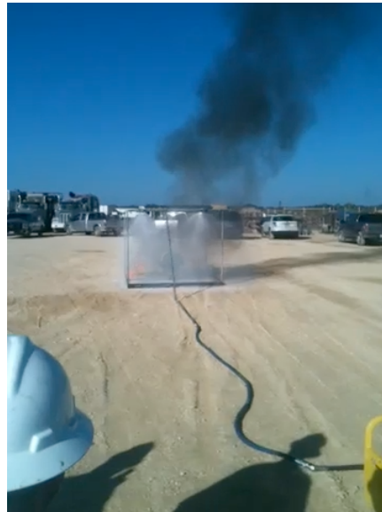
@ 2 seconds