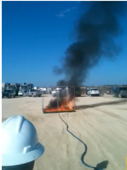
Video: @ 0 seconds