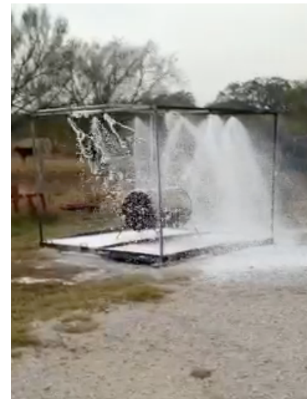
@ 17 seconds